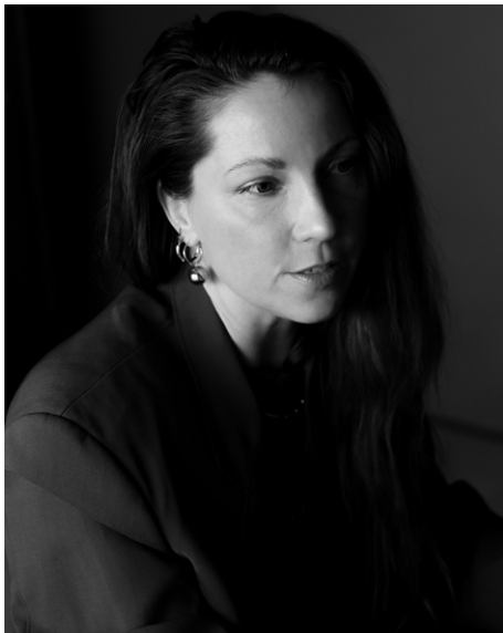
www.mae-engelgeer.nl Instagram: @maengelgeer